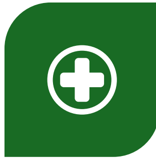
AIR ST. LUKE'S GROUND TRANSPORT